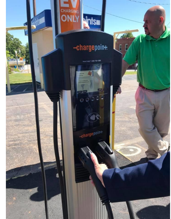
Accomplishments: Community Projects — Electric Vehicle Charging Station