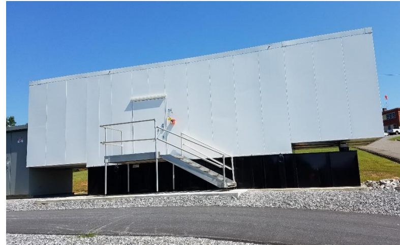
Water Plant Generator