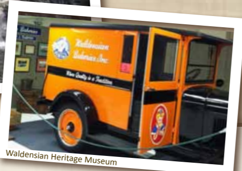
Waldensian Heritage Museum