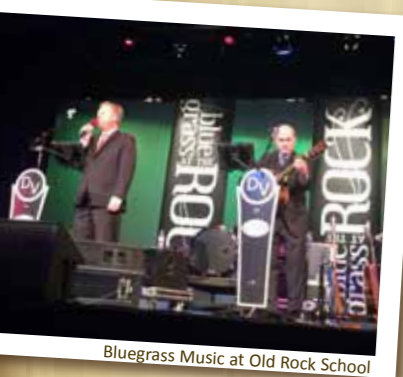
Bluegrass Music at Old Rock School

Today, through artifacts, attractions and special events, Valdese honors its French-Italian heritage and shares the story of the Waldenses' heritage and their journey to prosperity.