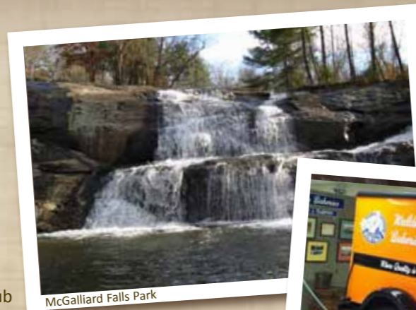
McGalliard Falls Park