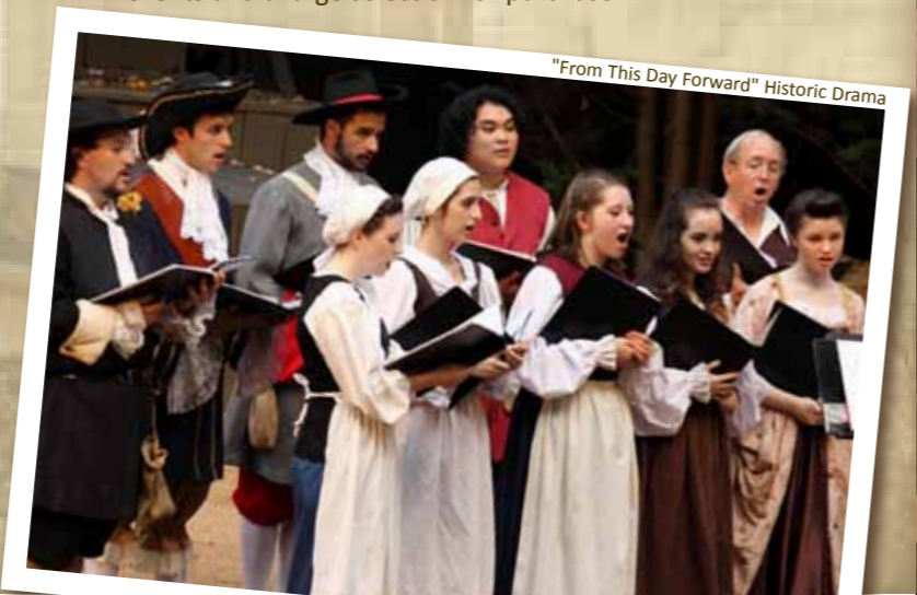
"From This Day Forward" Historic Drama

The Waldensian Winery represents more than 250 years of wine making. The Winery offers special tours, tasting events and a large selection for purchase.