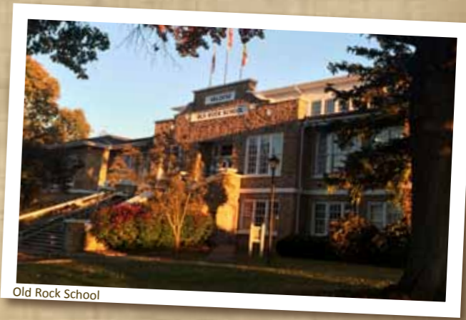
Old Rock School

HOTELS HAMPTON INN 828-432-2000 COMFORT INN OF MORGANTON 828-430-4000 B&Bs INN at GLEN ALPINE 828-584-9264 (888-441-5133) ROBARDAJEN WOODS 828-584-3191