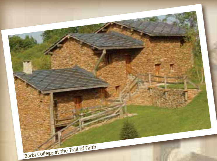
Barbi College at the Trail of Faith