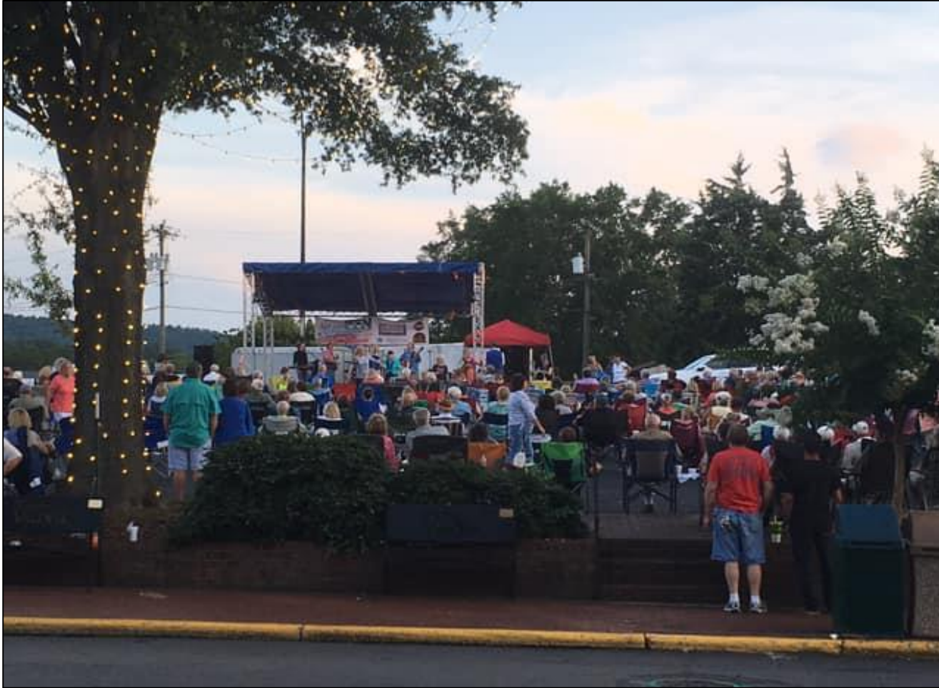
2019 FFN Concert Series