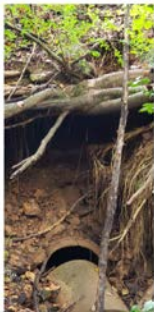
Erosion undercutting Pineburr(North side)