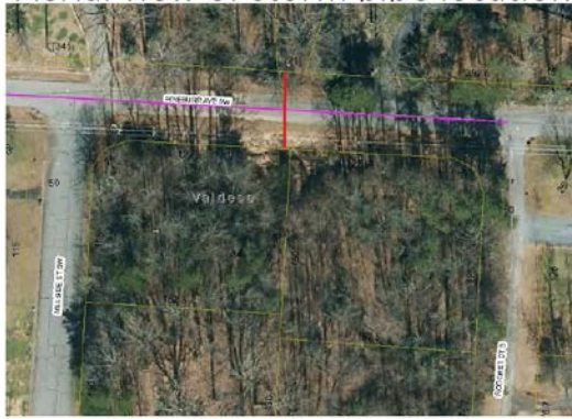
Aerial view of storm pipe location