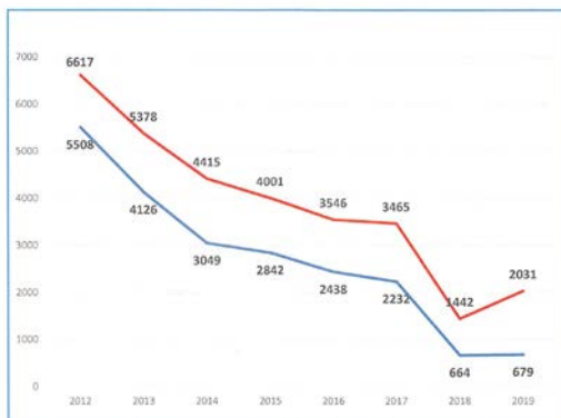
Burke County 2012-2019 Cats - Intake and Euthanized