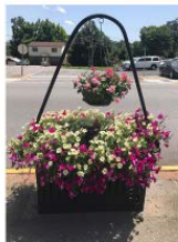
Accomplishments: Downtown Revitalization