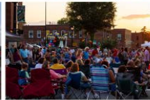
Accomplishments: Community Events