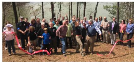
Accomplishments: Community Projects - Valdese Lakeside Park