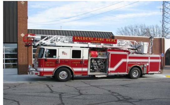
Accomplishments: Ladder 1: 2018 Pierce Enforcer 75' Quint

Fire, Police, Public Works, Recreation, Community Affairs, Water & Wastewater