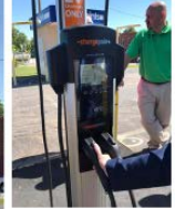
Accomplishments: Community Projects - Electric Vehicle Charging Station