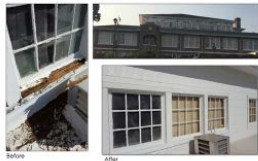
Old Rock School Exterior Renovation & Painting