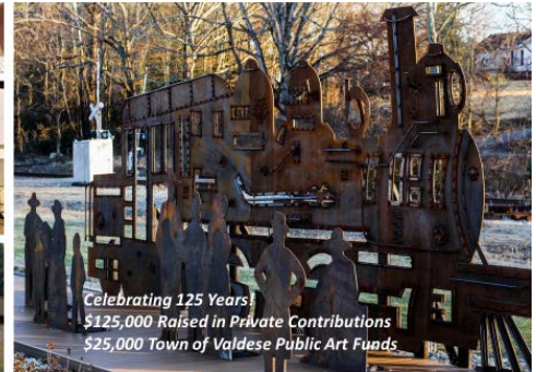
Accomplishments: Community Projects - The Arrival