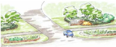
Entry Road, Parking, Restrooms, Storm Drainage, Signage, Landscaping Connecting Paths