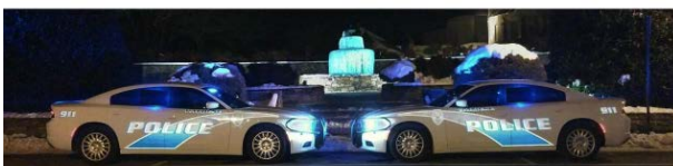
Accomplishments: Purchase of Police Vehicles