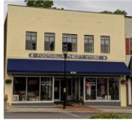
Accomplishments: Downtown Revitalization - Façade Grants